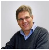
President-elect Dirk Blom (South Africa)